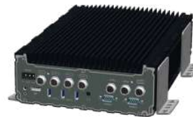
▲ SEMIL wall-mounted