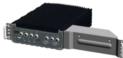
▲ SEMIL 19" rack-mounted